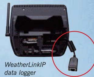
WeatherLinkIP data logger installed in Vantage Vue console.

WeatherLink.com is Davis' global weather network with thousands of weather stations reporting. Each reporting station has its own page on the site and is shown on the map as a temperature-color-coded dot that makes it easy to see temperatures worldwide. Click on a dot to see current weather conditions for that station. Each WeatherLink.com account also includes a private page with enough storage capacity to store up to two years' worth of weather data.