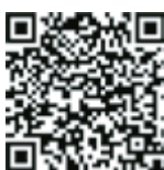
6557 WeatherLink Android App